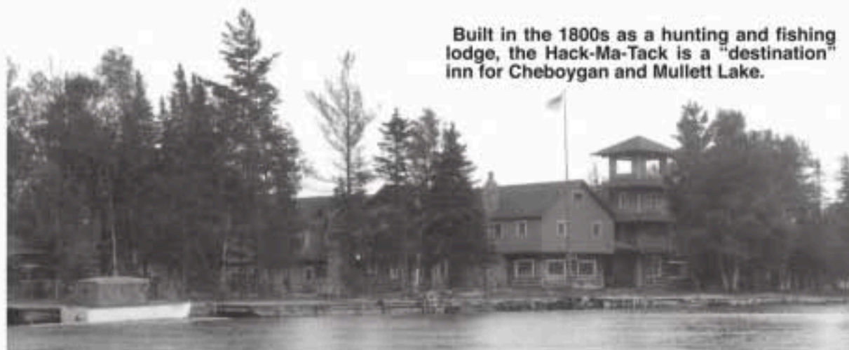
Built in the 1800s as a hunting and fishing lodge, the Hack-Ma-Tack is a "destination" inn for Cheboygan and Mullet Lake.